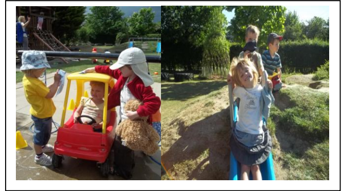
lunch and tidy up times.

We have been enjoying beautiful weather so far this summer which means we have been able to spend lovely long days learning outside in the garden amongst, (I must say) some amazing thriving vegetable seedlings and wild flowers which were planted and taken care of by the children. Thank you very much to all of our keen little gardeners who have been helping to water them!